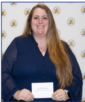
Florence Mathis Elementary