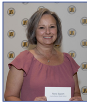
Central Baldwin Middle