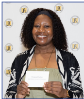
North Baldwin Center of Technology