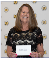
Spanish Fort High