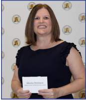
Baldwin County Virtual Secondary