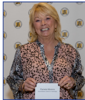
South Baldwin Center of Technology