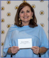
Baldwin County Virtual Elementary