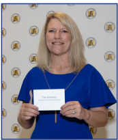
Fairhope West Elementary