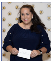
W.J. Carroll Intermediate