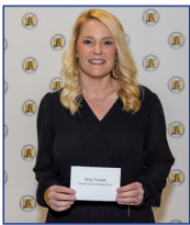
Fairhope East Elementary