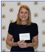
Spanish Fort Elementary