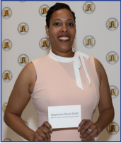
Baldwin County Virtual Middle