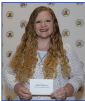
Pine Grove Elementary