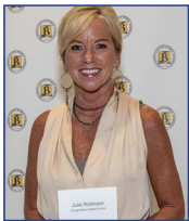
Orange Beach Middle