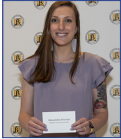
Baldwin County High