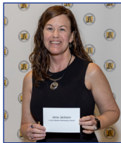
J. Larry Newton Elementary