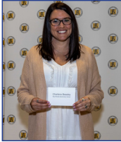
Bay Minette Elementary