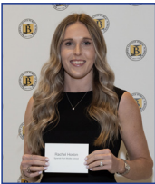
Spanish Fort Middle