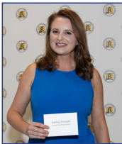
Orange Beach High