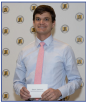
Daphne East Elementary