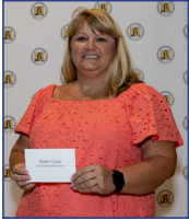
Bay Minette Middle