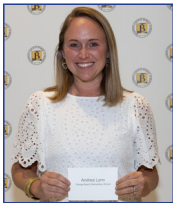
Orange Beach Elementary